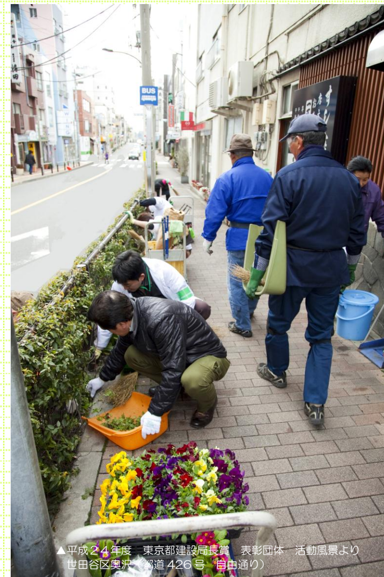
▲平成24年度 東京都建設局長賞 表彰団体 活動風景より 世田谷区奥沢(都道426号 自由通り)