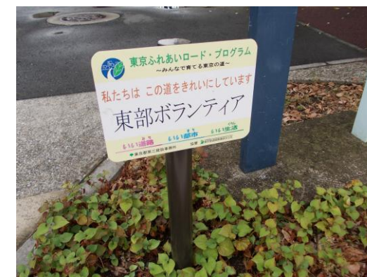
▲ Sign board