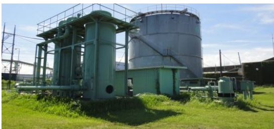
Auxiliary equipment of gas-gathering facility (desulfurizer, gas holder)