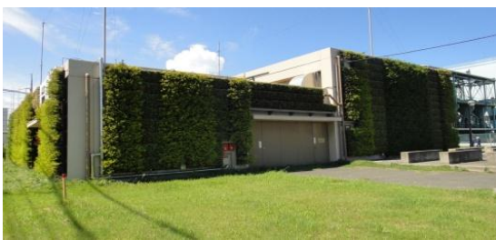
Power generator building of gas utilization facility