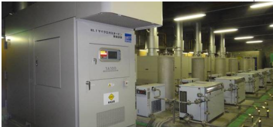
Micro gas turbine generator