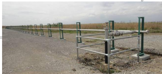
Outer gas-gathering line